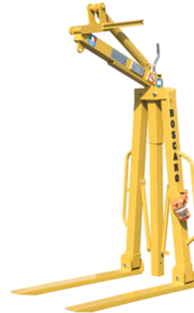
Volantino di bloccaggio

We proudly present you our MBA-A series. The product is designed and manufactured using high quality steel to guarantee strength and safety in the workplace. The fork offers automatic compensation and adjustment of the center of gravity depending on the weight of the load. You can lift loads weighing up to 3000 Kg depending on the fork dimensions you choose (see the table below). It can easily adapt to different weights, width and different types of loads. The closing lock is operated and controlled by means of a hand-wheel. We offer a wide range of fork models, you can check them on the main menu or see them in action in our photo gallery. All our forks are built to meet or exceed the regulations of ECC UNI-EN and ASME and come with the required labels, certificates and user and maintenance manual. All our products are covered by a 1-year warranty (EU Directive).